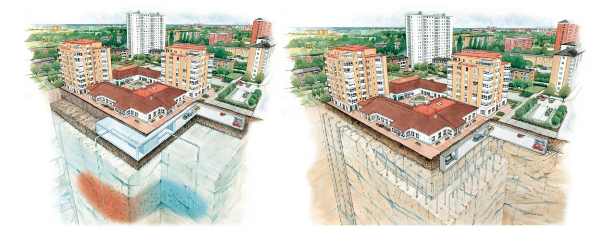
Figure 2: Aquifer Thermal Energy Storage (ATES) (left) and Borehole Thermal Energy Storage (BTES) (right). Illustration: Geotec.

While shallow geothermal energy extraction systems are passively recharged by heat transport in the underground from the ground surface and with a minor contribution from the geothermal heat flux, underground thermal energy systems (UTES) actively store heat and cold in the underground, commonly as seasonal storage. This means that heat is stored from the summer season to be utilized during the winter season. Likewise, cold is stored during winter to be recovered during the summer for cooling purposes. Most of the Swedish larger shallow geothermal energy applications combine heating and cooling. The two commercial systems are Aquifer Thermal Energy Storage (ATES) and Borehole Thermal Energy Storage (BTES). These are principally illustrated in Figure 2.